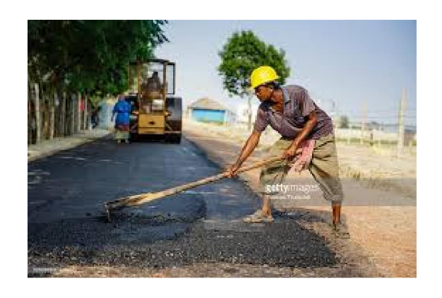
4.5 KM Road Earth work@Gauronodi, Barisal under LGED