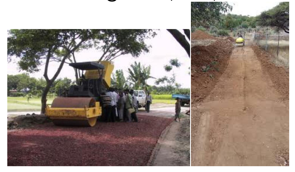
2 KM Road Maintenance @Sreepur, Gazipur

3 KM LGED road @ Baoultoli, Baufol, Patauakhali